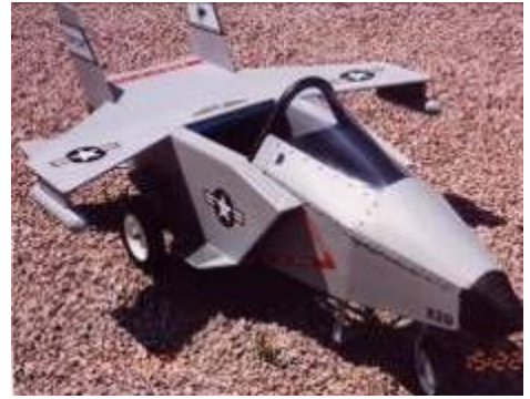
TOP CAT PEDAL PLANE

I built this "Top Cat" pedal plane for my first grandson. He is now 21 years old, so it was quite a while ago. I no longer have the plans for the Top Cat, but I do have the plans for a Tiger Moth. If anyone would like to borrow them give me a call.