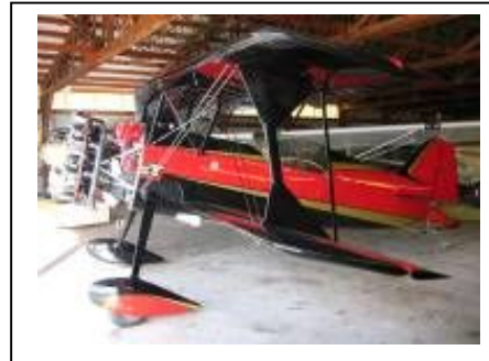
Pitts Model 12