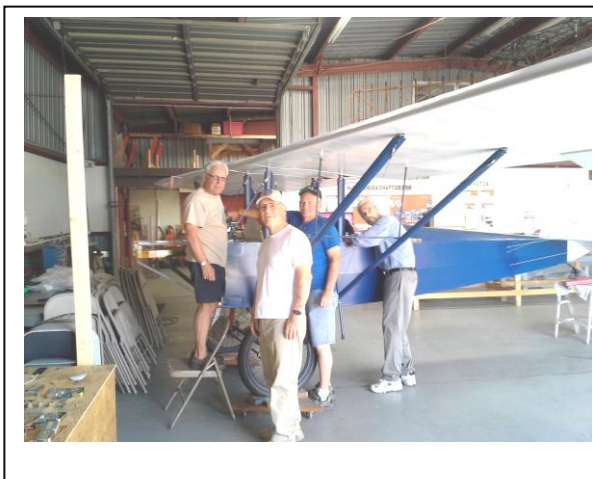
Chapter members enjoying their work....