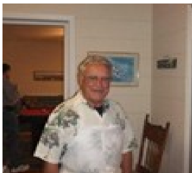
Our Host and Chief Bottle washer.