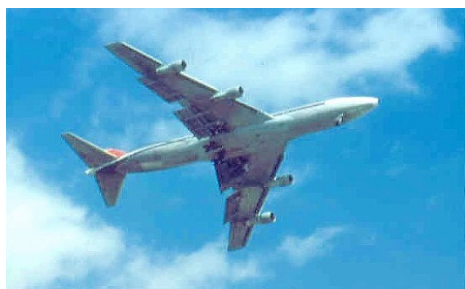
OSH '87 airshow "heavyweight," a lightly loaded 7-4 in slow flight.